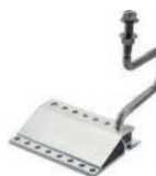
Item no. 03-000254