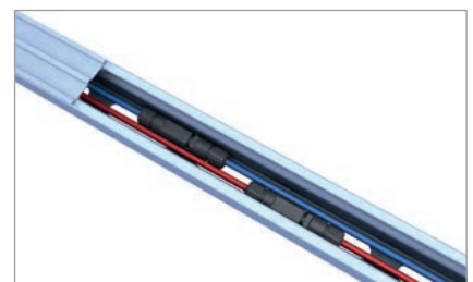
C-rail as cable channel