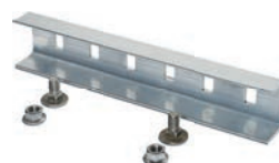
Item no. 03-000001