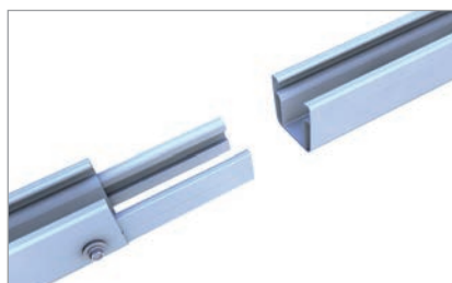
C47 S rail connectors for profile clamps