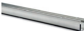
Item no. 03-001369