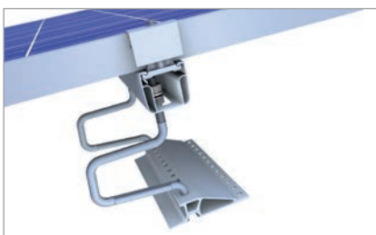
Double roof hooks for heavy snow loads