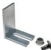
Item no. 03-000259