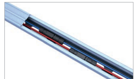
Flush closure end clamp with C-rail