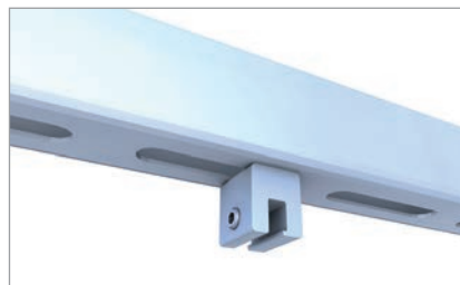
C-rail connection directly on the seam clamp