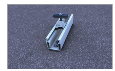
Middle clamp in short rail C47