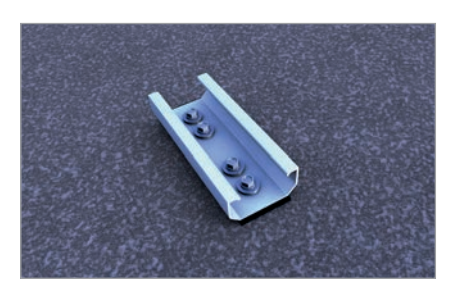
short rail C24 with four mounting screws for high wind loads