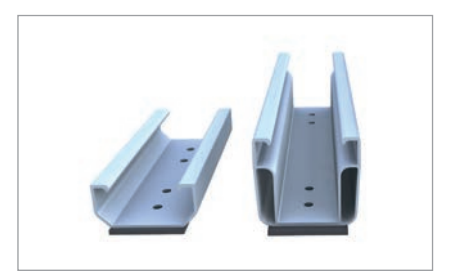
Short rails C24 and C47